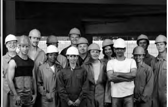
PROVIDING INFORMATION ABOUT YOUR...